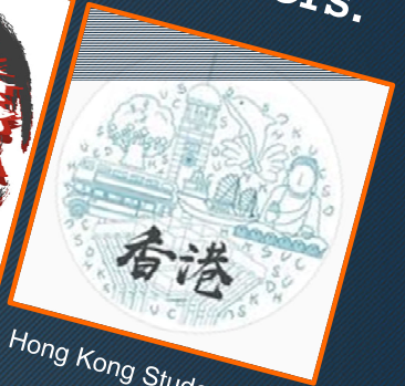
Hong Kong Student Union