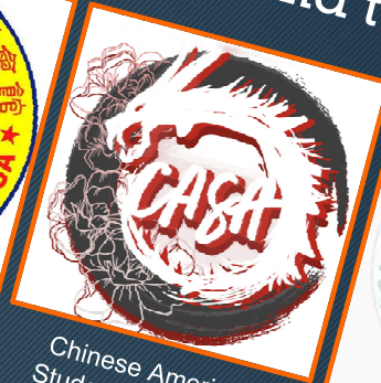
Chinese American Student Association