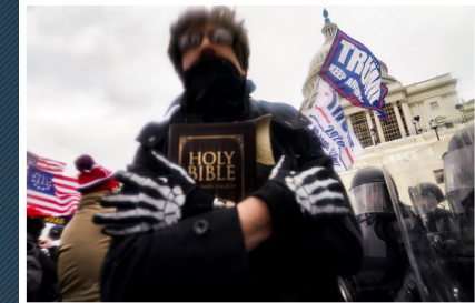
In this Wednesday, Jan. 6, 2021 file photo, a man holds a Bible as Trump supporters gather outside the Capitol in Washington, D.C. The Christian imagery and rhetoric on view during the Capitol insurrection are sparking renewed debate about the societal effects of making Christian faith with an exclusionary brand of nationalism.